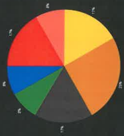
Legend for Time of Day: 00:00-01:00 01:00-02:00 02:00-03:00 03:00-04:00 04:00-05:00 05:00-06:00 06:00-07:00 07:00-08:00 08:00-09:00 09:00-10:00 10:00-11:00 11:00-12:00 12:00-13:00 13:00-14:00 14:00-15:00 15:00-16:00 16:00-17:00 17:00-18:00 18:00-19:00 19:00-20:00 20:00-21:00 21:00-22:00 22:00-23:00 23:00-00:00